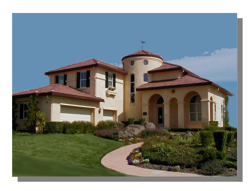
44 Sunny Lane, Malibu Spectacular View of the Ocean